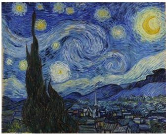
VINCENT VAN GOUGH

This unit aims to develop learners' skills and knowledge of how historical and cultural influences inform art, craft and design. Learners will achieve this by researching and recording information, whilst developing critical and analytical skills, and relating this to their own developing practice.