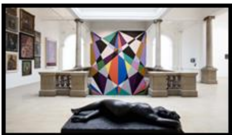
The Yorkshire Sculpture Park

Over the summer we would like you to visit an art gallery and document your experience alongside your summer work. You could present this as a series of photographs, a diary page or illustrated guide/map. Consider visiting one of the following :