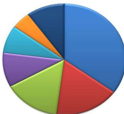
Market share in the UK supermarket industry

TASK: The pie chart below shows what % of the market the 6 biggest UK supermarket chains control. Use your existing knowledge of the industry to try and identify which segment of the chart represents which supermarket chain. 10% of the chart can just be labelled 'other'.